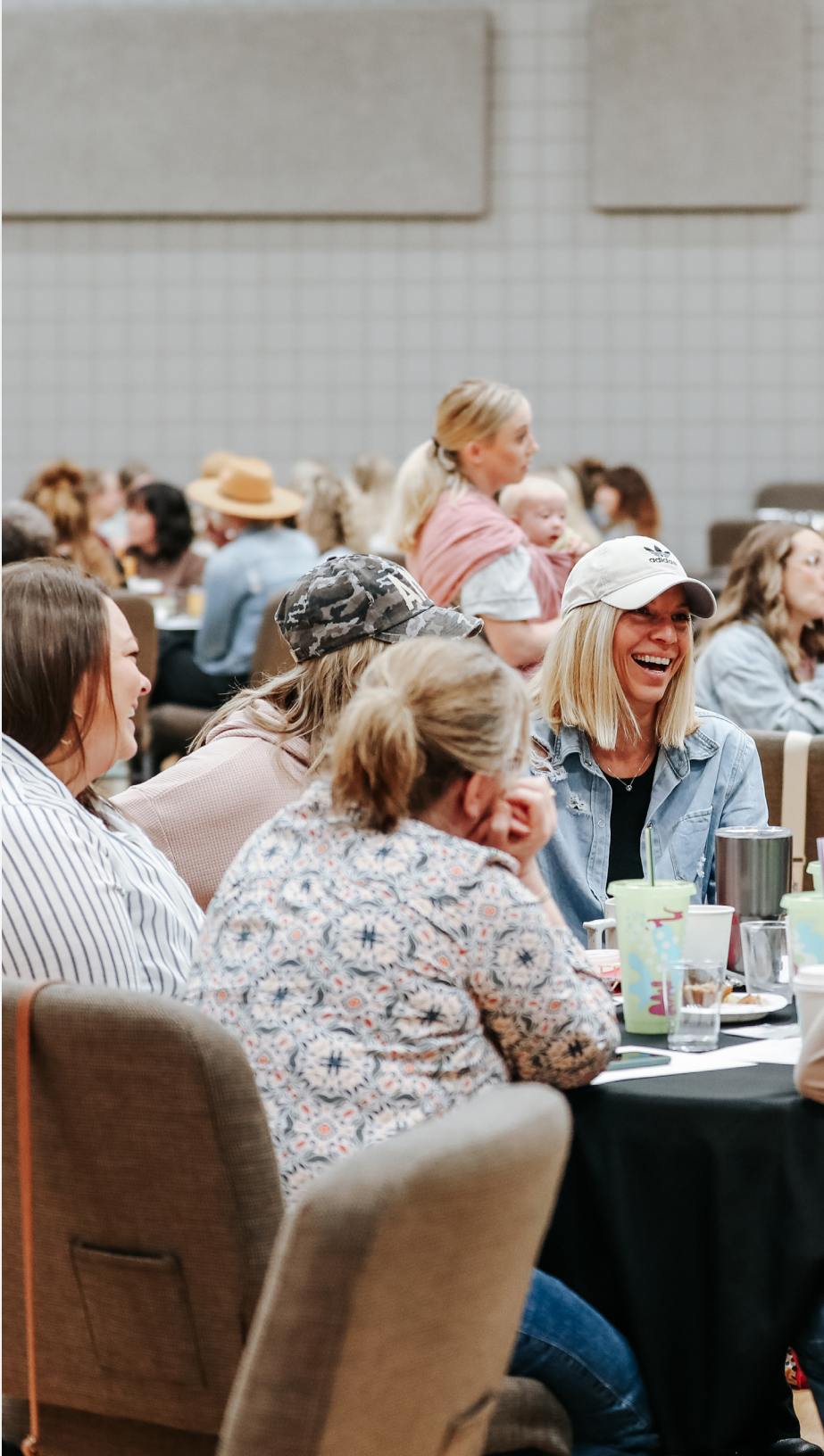
CHAPEL POINTE | 2024 ANNUAL REPORT